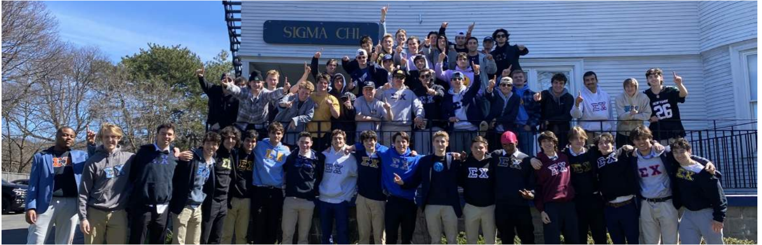
Psi Psi Undergraduates celebrating post initiation

We are having a party! Join us in celebrating the 120th anniversary of the Psi Psi Chapter and our successful return to prominence at Syracuse University. We are expecting a large turnout of alumni for Homecoming Weekend. This is the year and the party for you to return and celebrate! Put Saturday November 2, 2024, on your calendar.