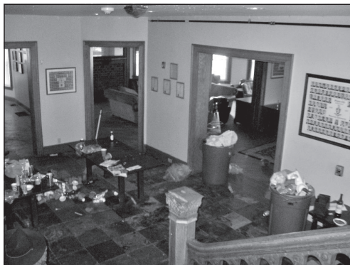
First floor common area.