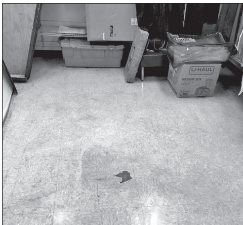
Ritual closet—after clean up.