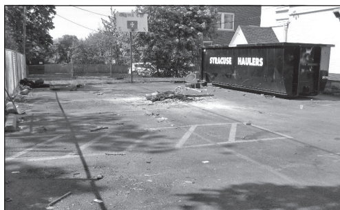
Parking lot bonfire.