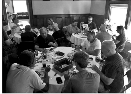
Saturday family-style dinner at the house.

Over the most recent decade we have worked to bring back reunion traditions like homecoming and clam bake. To be honest, those events are not widely embraced, for reasons I can't figure out. There always seems to be a "failure to communicate" issue with scheduling conflicts like Derby Days, initiation weekend, or something else that should have been prominent on the schedule but was not. And so, with some frustration over the quality of the connection time, I came up with the idea of a Psi