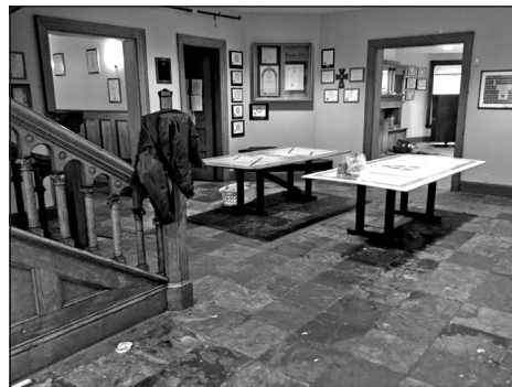
Stone flooring ready for its upgrade.

First, we filled two 30 cubic yard dumpsters with what seems to be a spontaneous generation of trashed couches and other items. The subsequent major undertaking is the removal and replacement of the foyer and dining room stone floor and the side stairwell flooring. Demo and preparation for new hardwood flooring in the foyer and dining room took a week, which found the sub-flooring to be in good condition. Installation of new oak flooring and application of an industrial grade sealant took another week, followed by sanding down and refinishing floors in the library and living and TV rooms. A composite rubber with gel coat finish is being installed in the side stairwell and self-serve food prep area. We are finishing up the final phase of the electrical rewiring of the house, with the cut-over of the basement and first floor circuits to new branch circuit breaker panels, adding/replacing a few outlets in the kitchen and throughout the main floor, and replacing the lighting in the dining room. The fire escape has been inspected, and new galvanized treads are being installed. We are replacing the exterior doors and several interior fire doors. We are