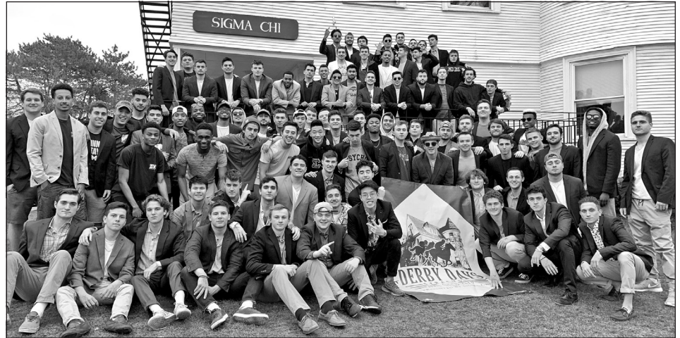
The brotherhood poses in front of the chapter house for the annual Derby Days picture.

This was only a highlight of a year of philanthropy and service. Psi Psi set a record, donating two full boxes of clothing to the Syracuse Rescue Mission. In October, Psi Psi co-hosted the "Sigma Hoops" charity basketball tournament with Phi Beta Sigma (a multicultural fraternity). In February, Psi Psi hosted their bi-annual blood drive. In April, Psi Psi joined with sorority Alpha Phi for their inaugural "Sig-Fil-Aphi," selling Chick-Fil-A Sandwiches