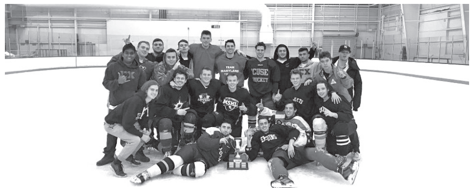
The intramural hockey team celebrates another championship.