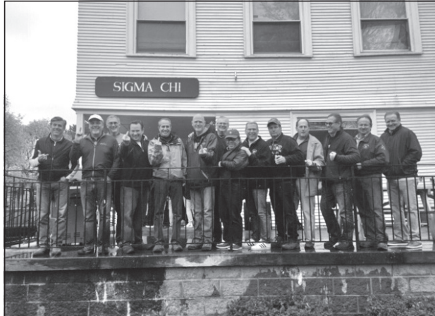
F-bombs away! Just because we got older does not mean we lost the spirit of youthful indiscretions!

It was another cold and blustery April day in Syracuse, but that didn't stop a record number of alumni and undergraduates from attending the annual Sigma Chi Psi Psi Clambake. From as far away as California and Florida, brothers traveled from all over the country to participate in the clambake, happy hours, House Corp. meetings, pub crawls, and dinners. Alumni and undergraduates discussed Psi Psi and Syracuse University stories that spanned more than 50 years—from living at 737 Comstock to Jim Brown at Archbold and lacrosse games in the dome—it felt like just yesterday when we were all there!