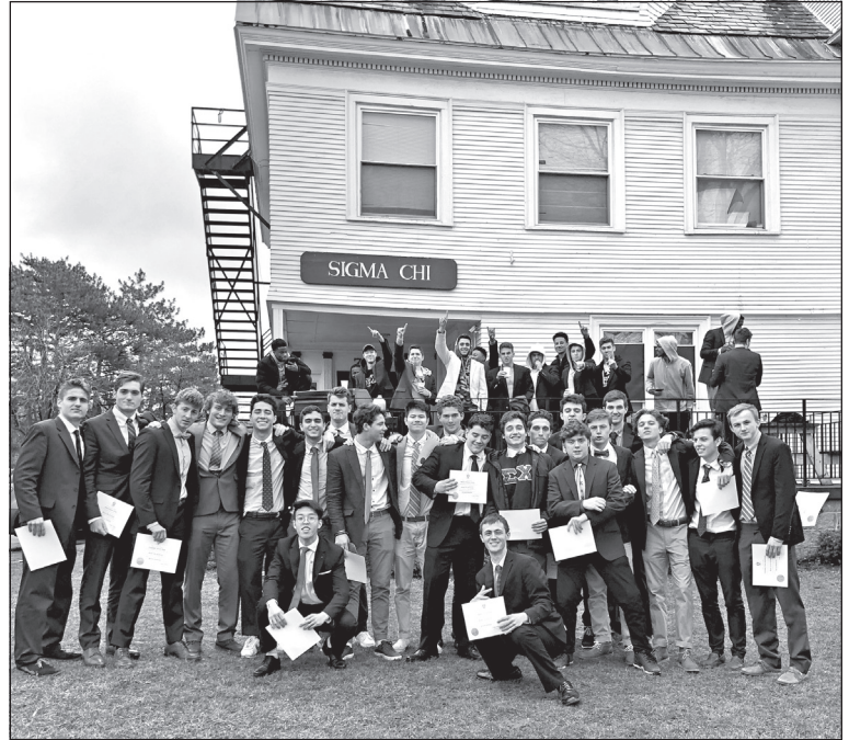
The spring 2019 pledge class poses for a picture after initiation.