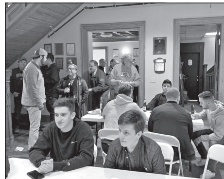
Alumni and undergraduate brothers share stories and memories.

affect decades of brothers to come. Many thanks to those who have served tirelessly on House Corp. and are committed to supporting the next generation of leaders.