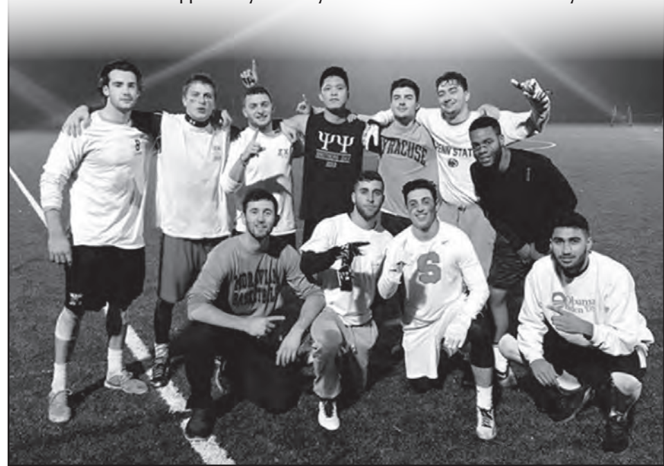
Psi Psi Chapter undergraduate brothers after a recent intramurals victory.