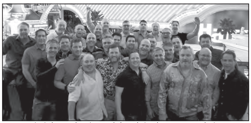
Psi Psi Chapter alumni out and about during the Las Vegas gathering.

The SALTINE SIG Published by Psi Psi of Sigma Chi at Syracuse University for its friends and members. News and photos should be sent to: Alumni Records Office, Psi Psi of Sigma Chi, P.O. Box 876, Ithaca, NY 14851-0876.