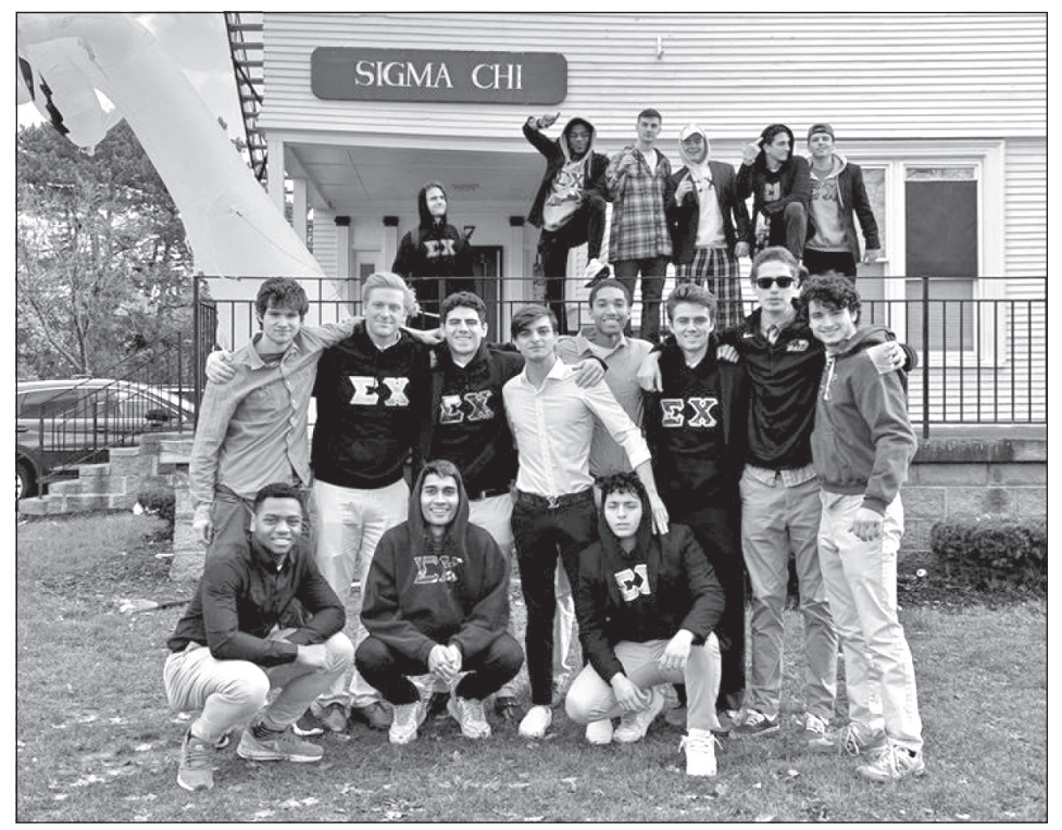
The spring pledge class.