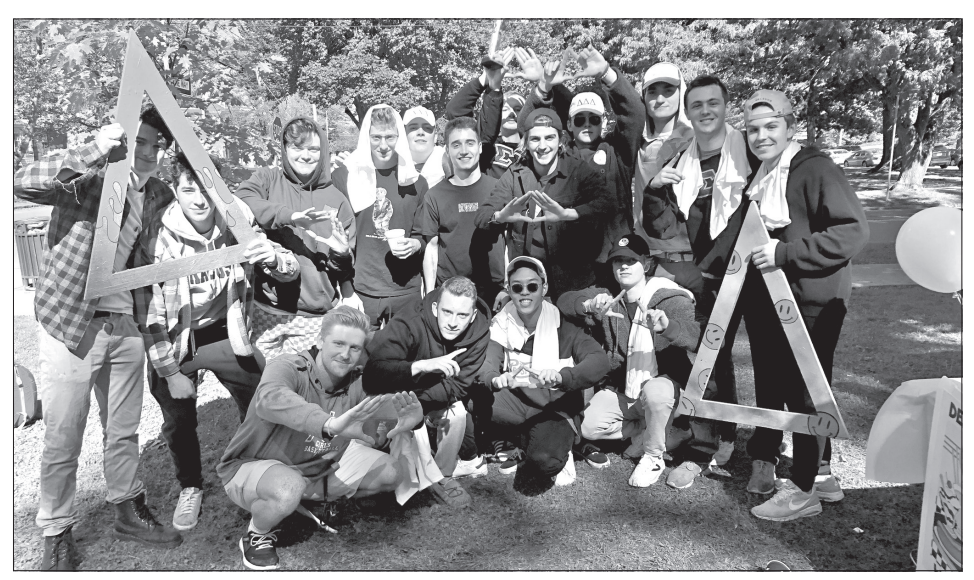
Brothers celebrate after winning the "Tri Delt Pancake" philanthropy event.

On November 1, our fall 2019 pledge class completed its community service project by spending the day moving boxes and restocking shelves at West Value Thrifty Shopper in Syracuse to help out the